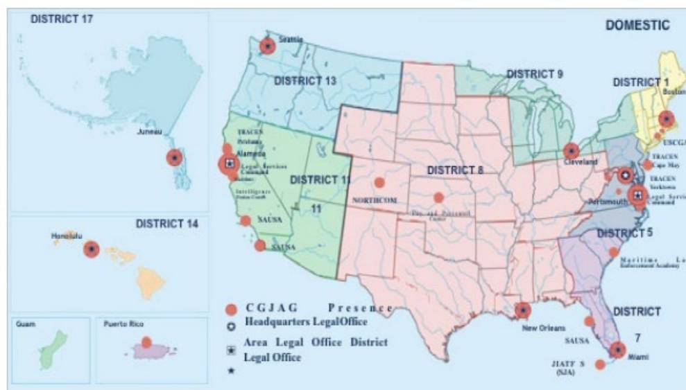
Location of CGJAG presence at various Coast Guard Offices throughout the Nation.